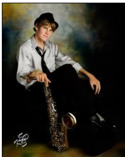
Likely to be Cropped